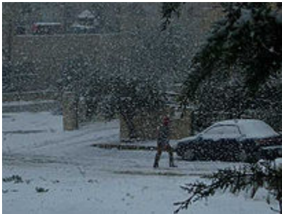
Spring in Amman